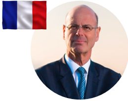
Eric LOMBARD Minister of the Economy, Finance and Industrial and Digital Sovereignty