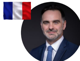
Laurent SAINT-MARTIN Minister Delegate for Foreign Trade and French Nationals Abroad