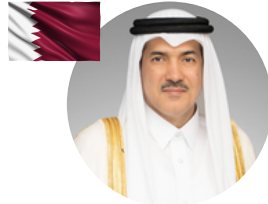
H.E. M. Ahmed AL SAYED Minister of State for Foreign Trade of Qatar